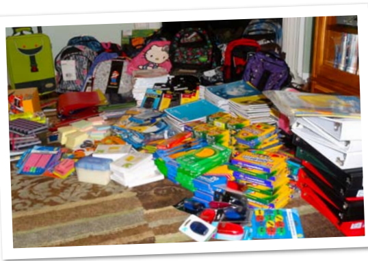
2011 Back To School Donations

The 3rd annual Back To School Drive was a HUGE success! Along with many donated school supply items, $350 in donations were collected, which was used to provide much needed backpacks and school supplies for the Women's Center of Wake County. Looking back, Philoptochos & Holy Trinity in 2009