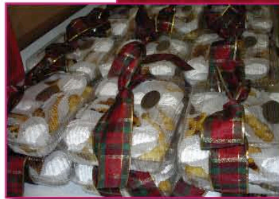
The Ladies Philoptochos Society of Holy Trinity Greek Orthodox Church

portion of the proceeds from their annual December bake sale contributing $5000.