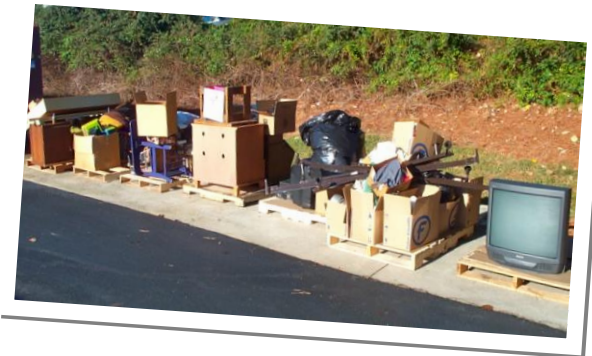
Above: Various donations from our parishioners, which benefited Helping Hand Mission who service the needy in our community. There is never an items to large or too small...all can help those in need!