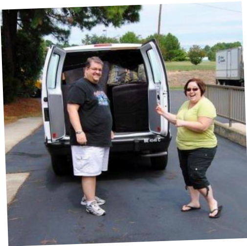
Left: YAM in action, again, helping us with furniture donations to those in need.