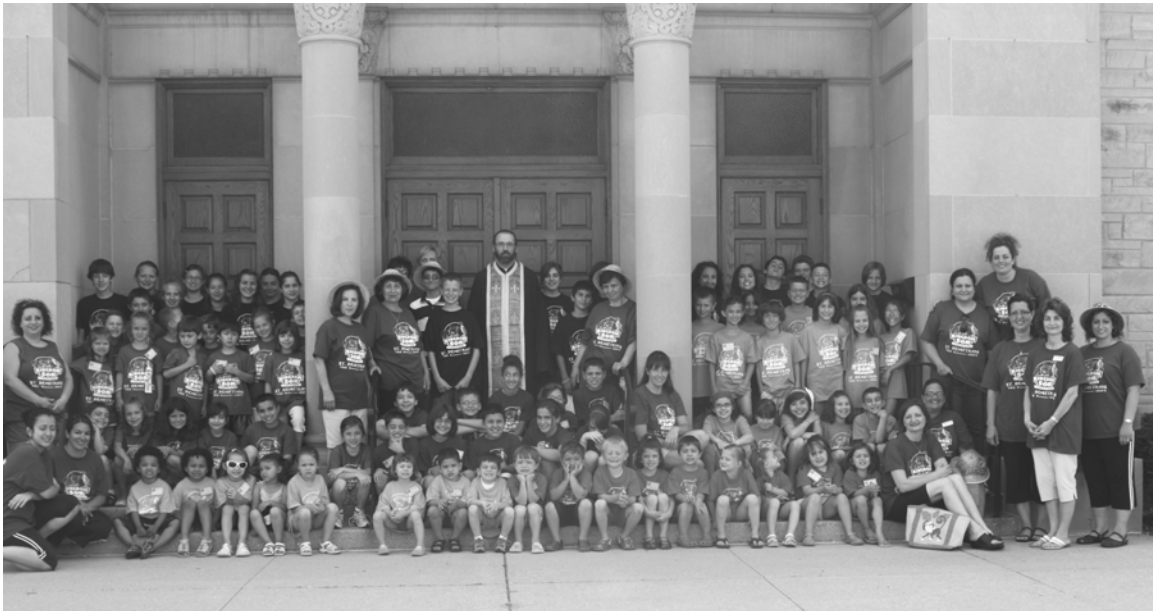
Vacation Bible School – June 2009

ParishWebsite: Parish Email: Article Submissions (by the 15 th of each month):